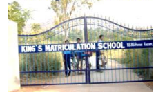
Reaching The Unreached

MEN'S LUNCH BUNCH meets at 11:30 a.m. on the fourth Thursday of the month at Gourmé Restaurant 15315 Pearl Rd. in Strongsville.