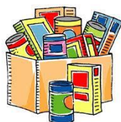
Feeding the Community

Our church continues to support the Strongsville Food Bank. Although all non-perishable items are needed, right now the bank especially needs peanut butter, jelly, pork and beans, canned meals, pasta sauce, canned fruit, and toilet tissue. You may place donations in (or by) the box under the coat rack by Pilgrim Hall.