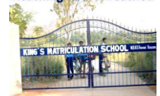
Reaching The Unreached