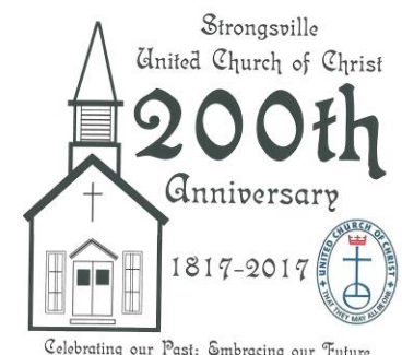
Celebrating our Past; Embracing our Future

Home to Native Americans, Strongsville was only known as number five of range 14 in the Old Western Reserve, as designated in the governmental surveys. In February 1816, eight pioneers ventured forward from Connecticut and arrived in Strongsville. They took steps to organize a church, and by the fall of 1817, the original eight people grew to 75 in number. October 12, 1817, the First Congregational Church of Strongsville was formed. As we begin our journey towards our 200<sup>th</sup> anniversary, we