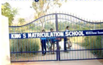
Reaching The Unreached